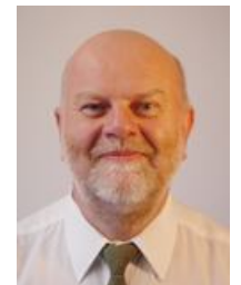
by Duncan Boddy

London ☎: 020 7329 1221 Norwich ☎: 01603 631396